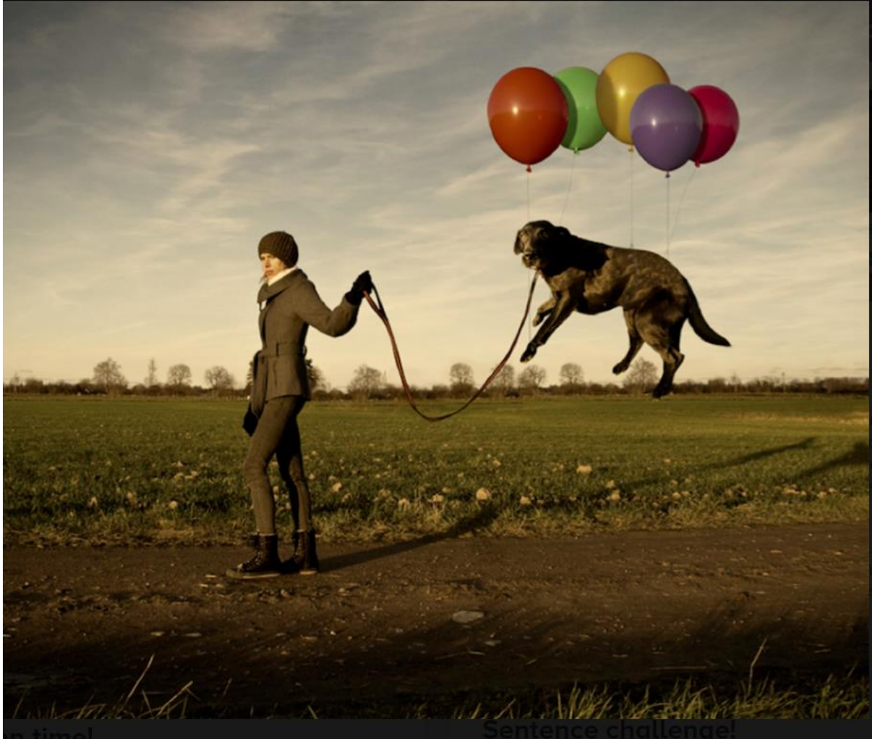
Keywords: dog, walking, balloons, floating, leash, surprise