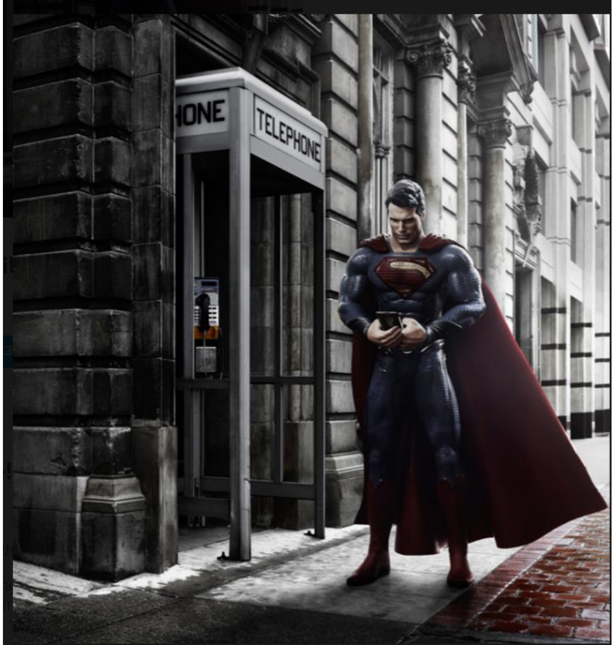
Keywords: Superman, superhero, phone box, telephone, distress signal, emergency, help, assist