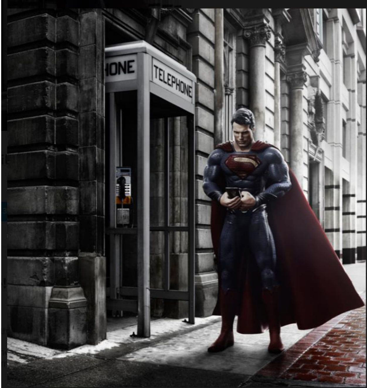
Keywords: Superman, superhero, phone box, telephone, distress signal, emergency, help, assist